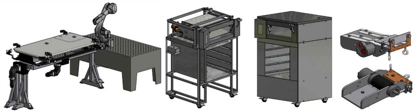
INDUSTRIAL EQUIPMENT (WELDING MANIPULATORS, BAKING OVENS, CRUSHERS ELEMENTS)

TECHNOLOGICAL TOOLS (METAL CIRCLE DISC CUTTER, FOLDING TOOLS FOR PRESS BRAKE), ROTATING WELDING TABLE