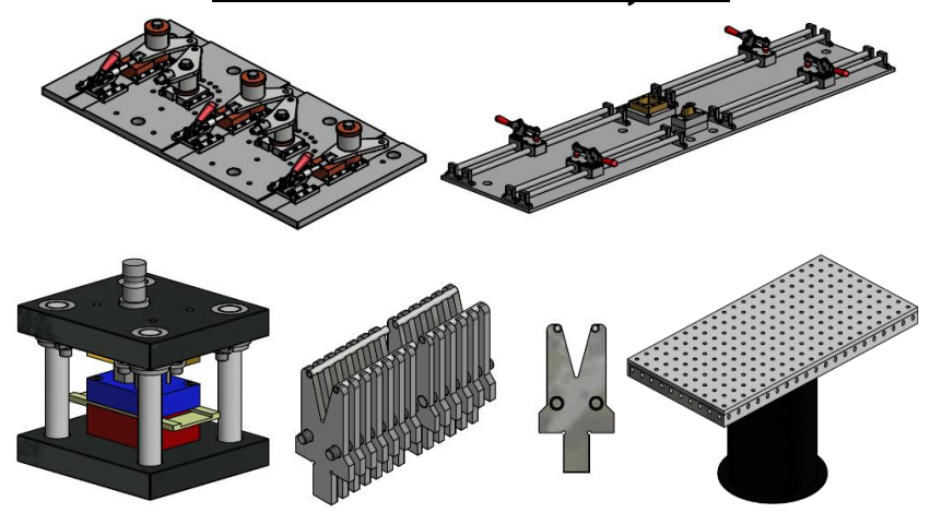
WELDING DEVICES (ADJUSTED TO WELDING ROBOTS)

TECHNOLOGICAL TOOLS (METAL CIRCLE DISC CUTTER, FOLDING TOOLS FOR PRESS BRAKE), ROTATING WELDING TABLE